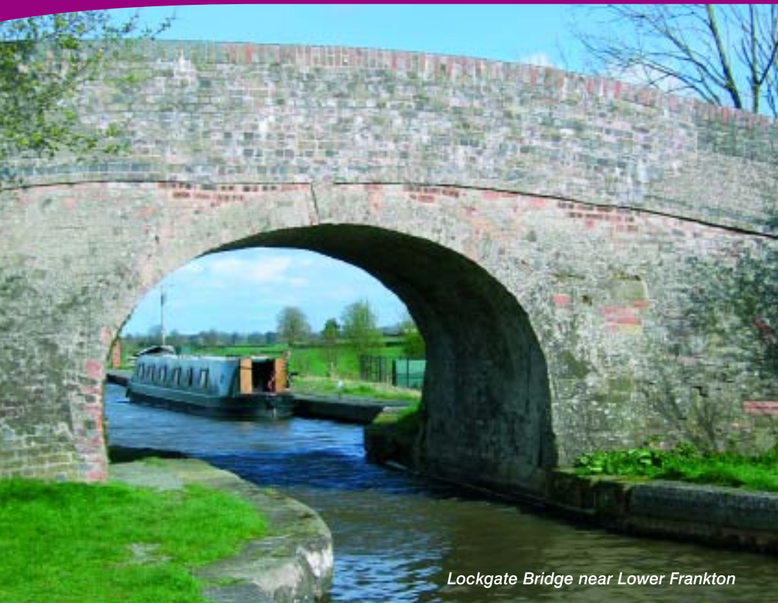
Lockgate Bridge near Lower Frankton

Starting at Heath House near Oswestry, this is a five mile, flat and off-road ride along the towpath, with a possible 4 mile extension along roads and a short section of towpath. Due to narrow towpaths, and deep water, both routes are only suitable for older children with good control of their cycles.