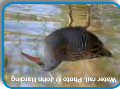
Water rail.

You are cycling next to the Old Shrewsbury Canal. The canal was opened in 1797 and officially closed in 1944. It brought barges all the way to town from the Shropshire Union canal near Market Drayton. The canal was abandoned and is now a valuable area for wildlife. You can walk or cycle along most of the canal route in Shrewsbury, from the Canal Tavern near the station out to the village of Uffington.