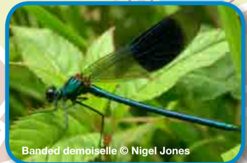
Banded demoiselle © Nigel Jones

This map is based on Ordnance Survey material with the permission of Her Majesty's Stationery Office © Crown copyright. Unauthorised reproduction infringes Crown copyright and may lead to prosecution or civil proceedings. Shropshire Council 100049049.2011